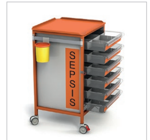
Optional digital lock on door.