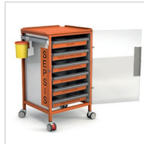
Standard anti-tamper door seal.